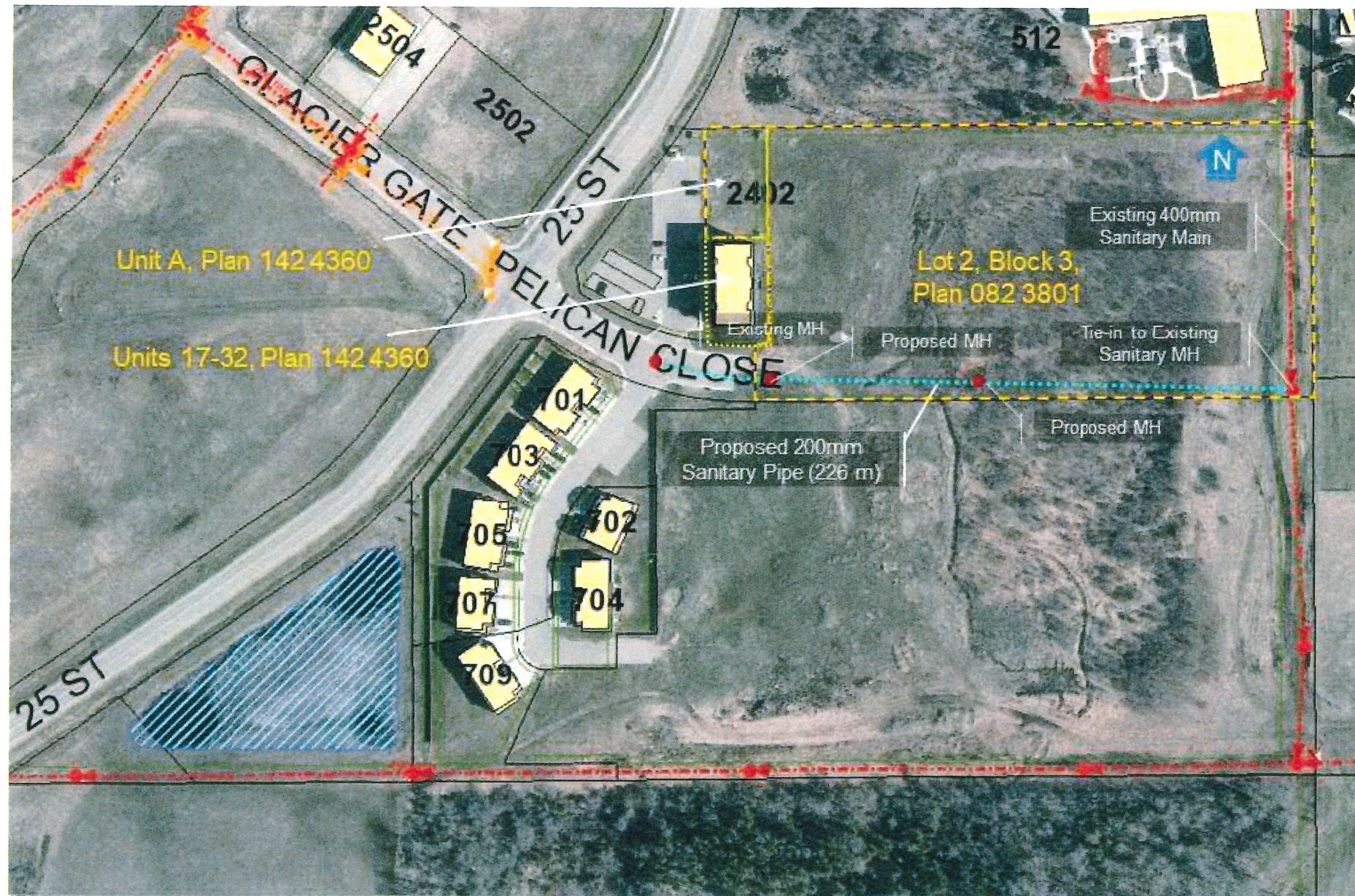
Figure 1: Proposed Sanitary Pipe